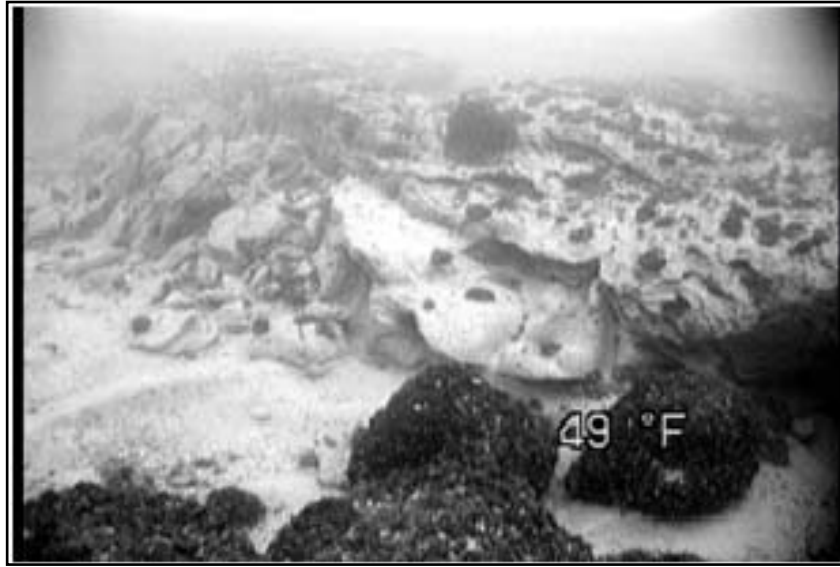
Figure 3. Underwater video image of cohesive clay ridge (light blocky material) surrounded by medium to coarse sand and large cobbles/small boulders. Dreissenids colonize the hard boulder cobble substrates but do not colonize the ablating cohesive clay deposits. Chiwaukee survey site south of Kenosha, WI. 8 m, October 2005.